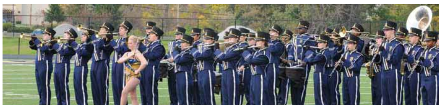
The SJJ Marching Band played the National Anthem and the Alma Mater as part of the pre-game festivities.