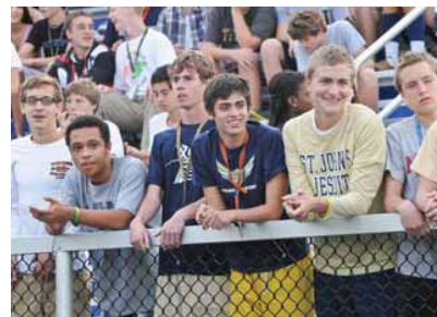
Titan fans cheered on the soccer team from the new home bleachers. There are 2,000 home seats.