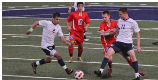
SJJ plays its first game under the lights.