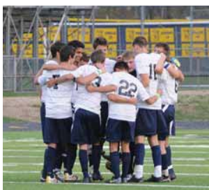
A Titan tradition, the pre-game huddle.