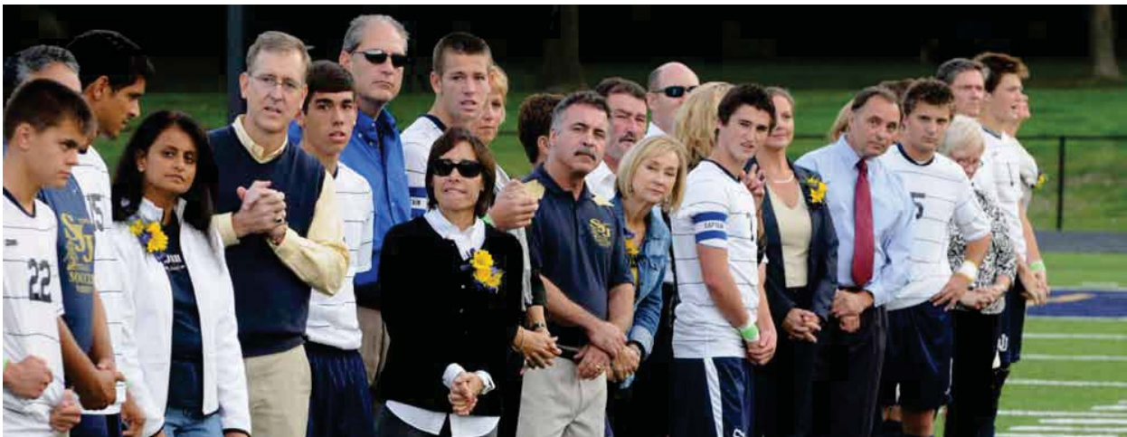
SJJ Soccer Seniors were recognized for their contributions to the Varsity Team at the dedication ceremony on Lyden Field.