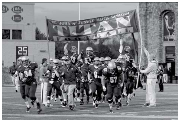
The Titans entered UT's Glass Bowl ready to win on October 14th.